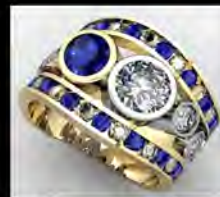
your new ring

2 South Main St. Yardley, PA 19067 215-493-1300