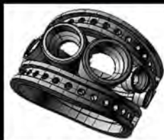
my CAD model