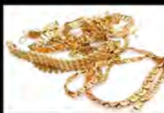
your scrap gold

GOLDSMITH • SILVERSMITH • PLATINUMSMITH GEMOLOGIST • APPRAISER