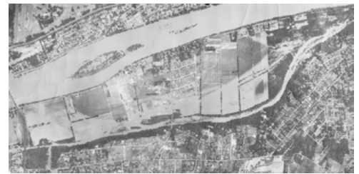
1955 Flood Map of the Delaware River (south of Yardley Borough)

Call or stop in at the Township offices if you need assistance with understanding this information. If your insurance policy has identified your home as a repetitive loss property, we can assist you with assessing options to mitigate potential flood damage. Call 267-274-1123 if you want to discuss your options with our Professional Engineers or Certified Floodplain Managers.