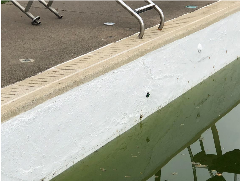
Figure 15 – Top 2 to 3 feet of Side Walls and Concrete Perimeter Gutter