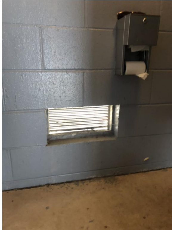
Figure 9 - South Bathrooms - Louvered Through-Wall Exhaust Vent