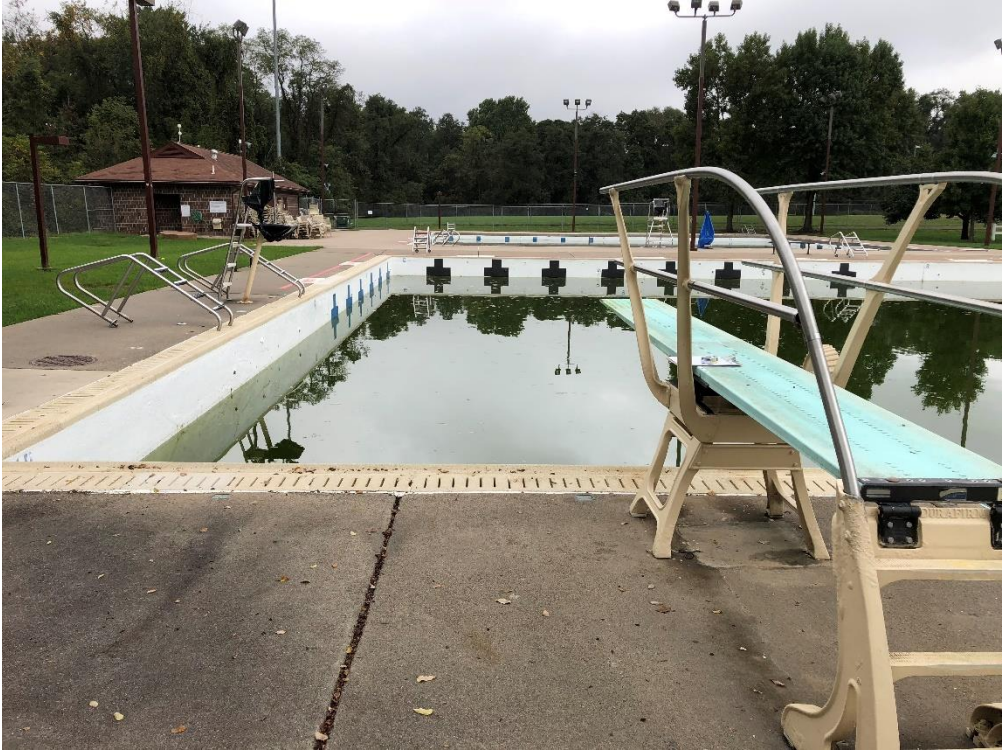
Figure 13 – Main L-Shaped Pool