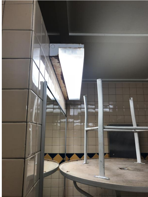
Figure 5 - Main Office Bathrooms - Rusted Fixtures