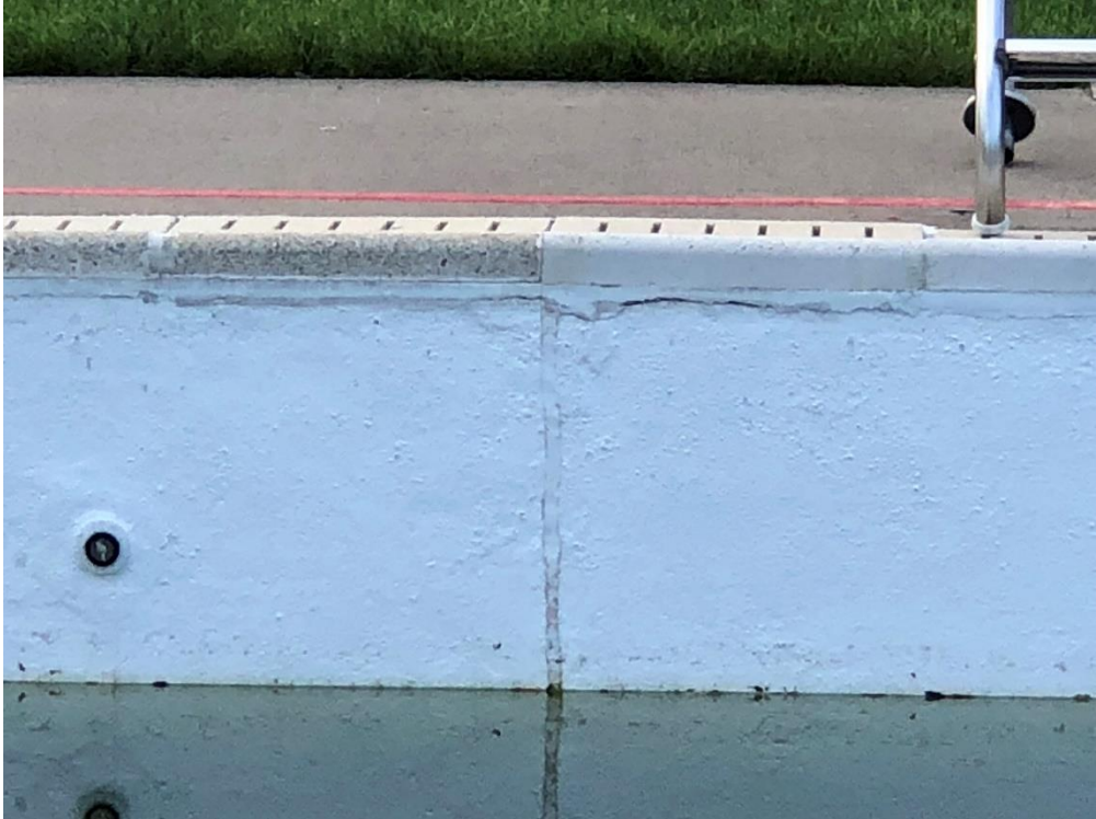
Figure 17 – Vertical Construction Joint and Horizontal Crack below Gutter