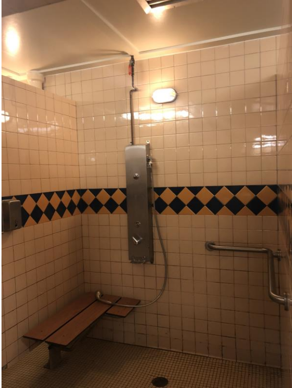
Figure 3 - Main Office Bathrooms - ADA Shower Stall