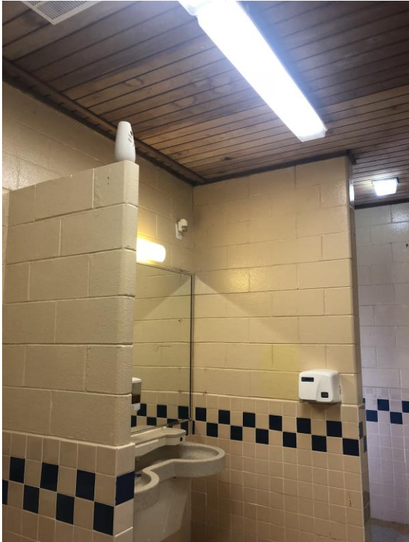
Figure 12 - North Bathrooms - Sink Area