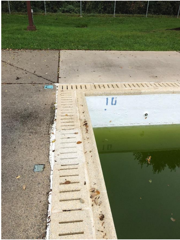
Figure 14 – Concrete Perimeter Gutter System