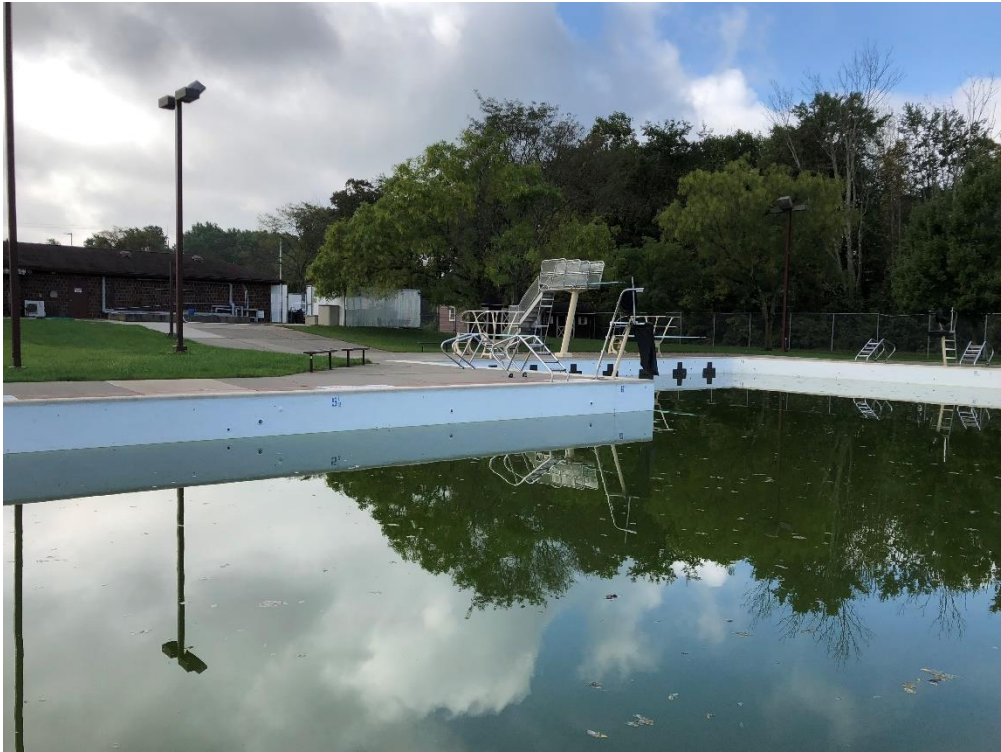
Figure 18 – Main L-Shaped Pool