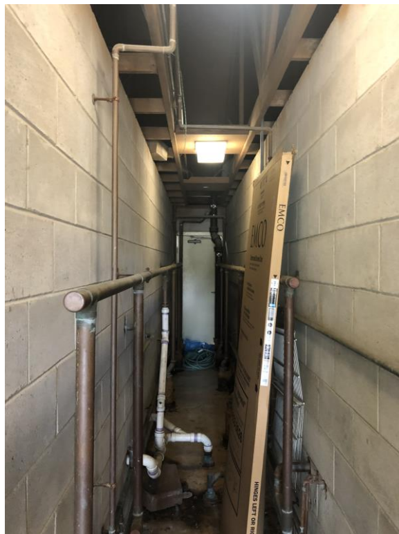
Figure 6 -Main Office Bathrooms - Interstitial Space with Attic Access