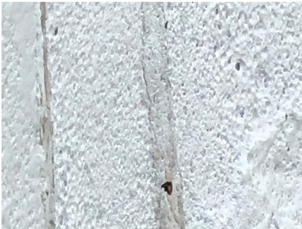
Figure 16 – Previous Crack Repairs and Surface Pitting