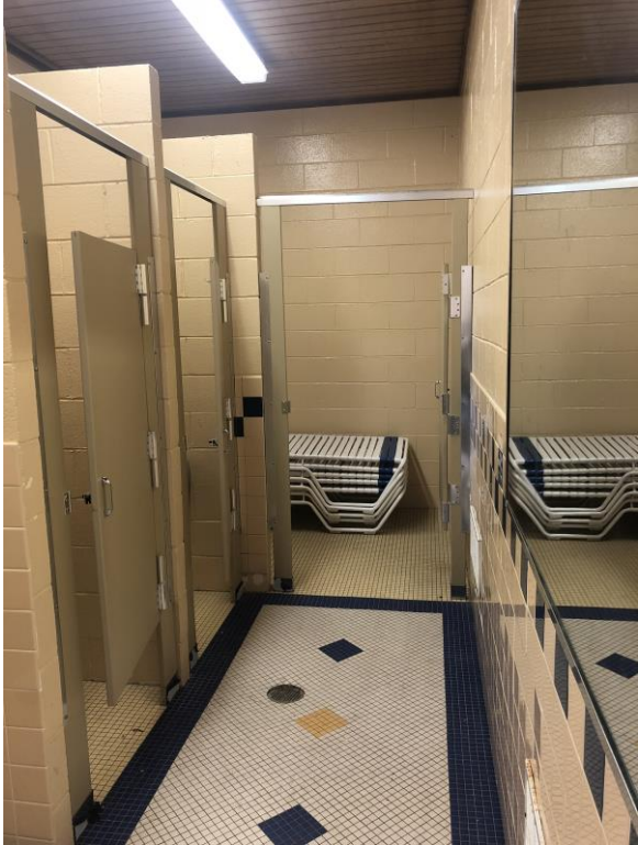
Figure 11 - North Bathrooms - Typical Interior Stalls with ADA Stall at End