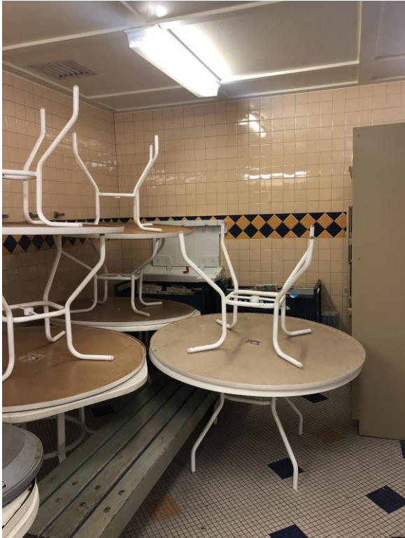
Figure 4 - Main Office Bathrooms - Bench and Lockers