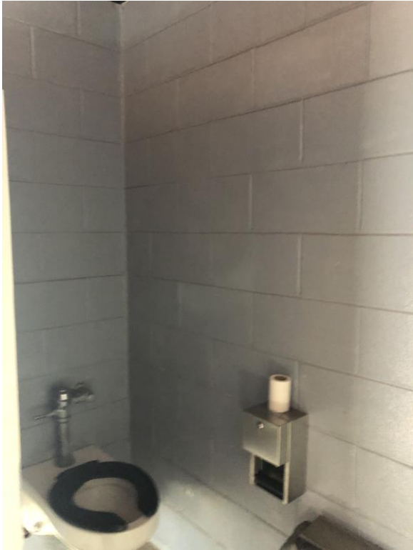
Figure 8 - South Bathrooms - Existing Water Closet and Fixtures