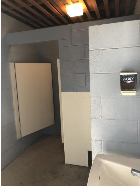
Figure 7 - South Bathrooms - Interior of Men's Bathroom