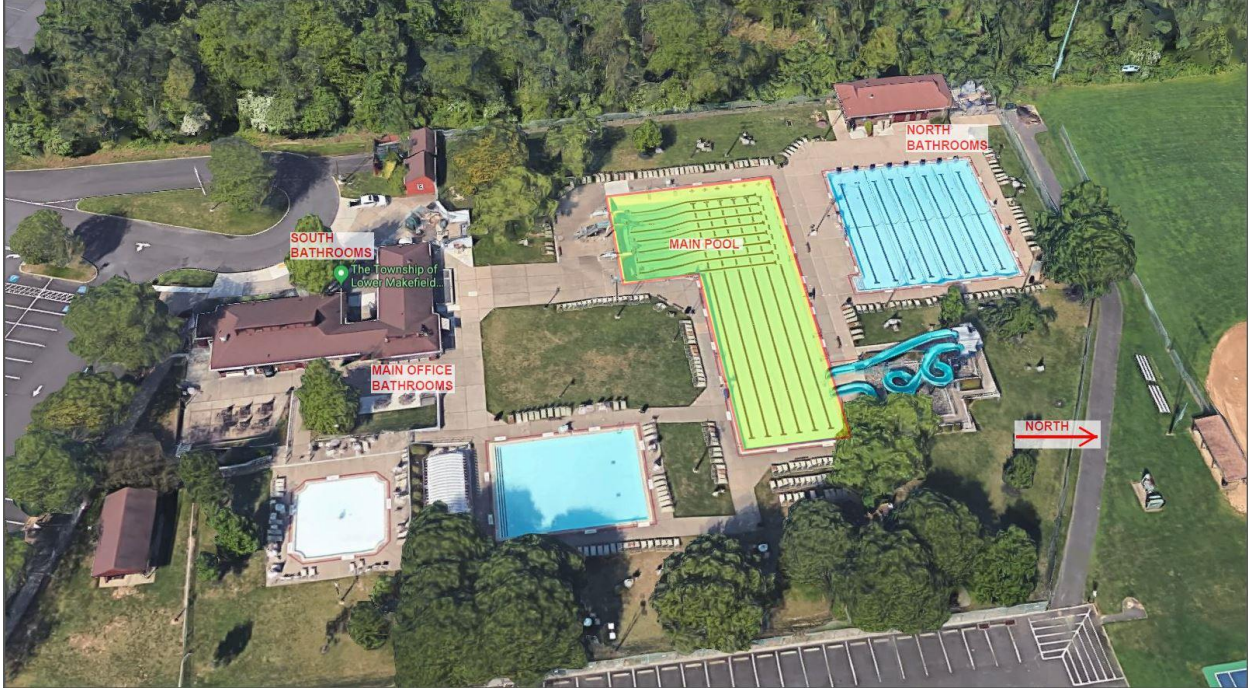
Figure 1 - Site Overview